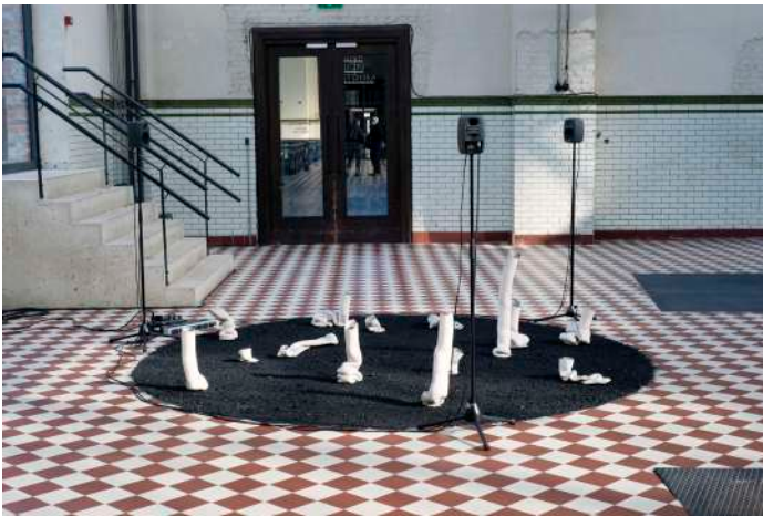
FOOL'S PARADISE, 2018