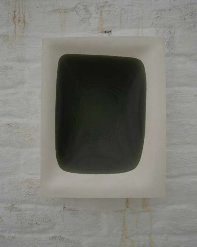
Sans-titre , 2023