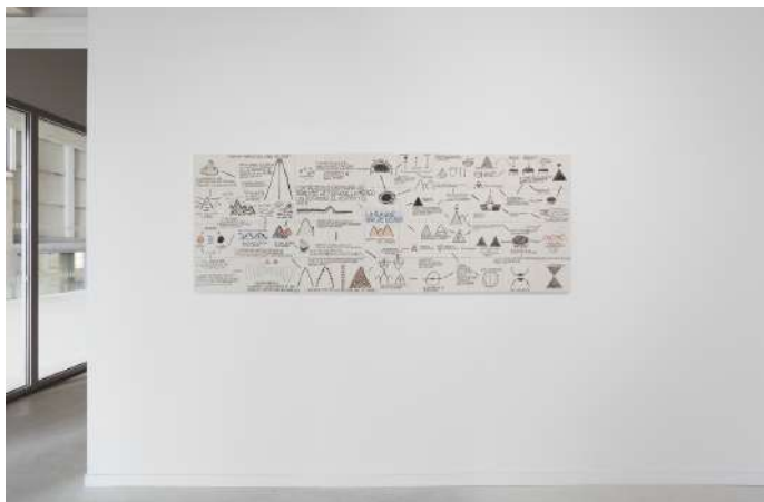
UNE VUE QUE TOUT EMBRASSE, 2021

Painted ceramic tiles products in the Terre du Château Coquelle workshops, in Dunkerque, 220 x 80cm