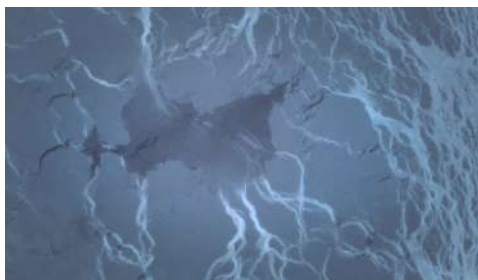
The monk , 2021