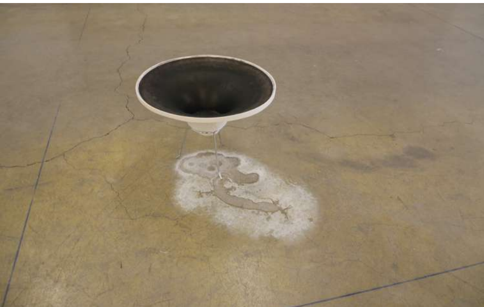
Obombre , 2022

It is a deposit, a sedimentation. By the flow of this tint, the plaster material is marked here this time of composition passed.