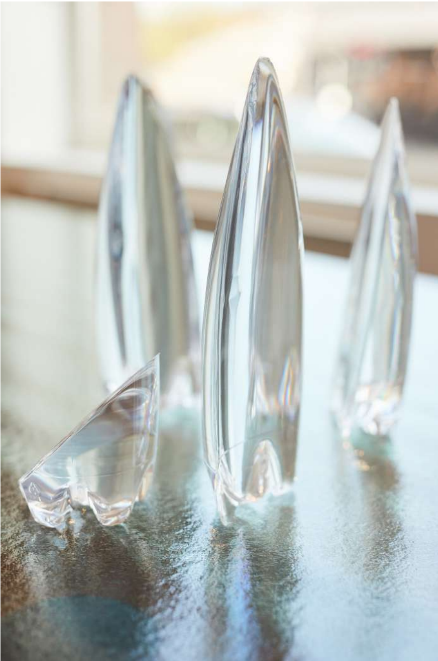
LIQUIDO , 2022, variable sizes, resin

Nienke Baeckelandt seeks the field of tension between intuition and control. Her works are always the result of «concentrations» or «intensities» of a snapshot. Site-specific installations and sculptures subtly play with the viewer's perception. She draws attention to hidden colours, objects or concepts. Areas of colour visible only from a specific point of view, fused transparent objects and light-coloured shadows. Current media and new technologies encourage that images should be consumed at a glance. Baeckelandt's images, on the other hand, encourage a slowing down.