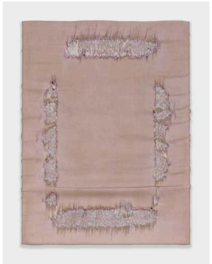
2) Peinture indisciplinée , september 2021 - present Humidity indicator, water, silk, 40 x 30 cm