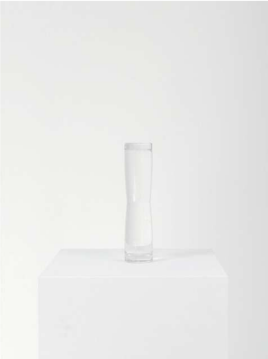
Actes 16, Can't Be Shared , since 2020 Borrowed glass from the space, water, variable size

Valérien Goalec lives and works in France. The forms of his work are extracted from their context in order to appropriate them and multiply them to obtain new rational forms. Goalec questions the relationship of the human body with the objects, spaces, daily rituals and tries to make visible what we have made invisible.