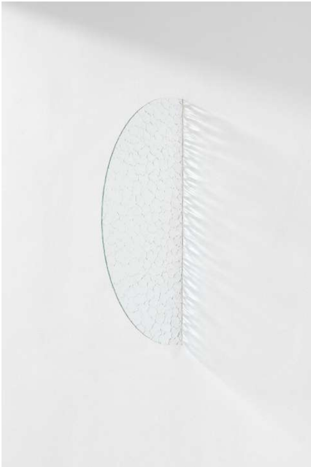
Waves , 2017 Oceanic glass, 70x37cm.

Lucie Lanzini cultivates a particular sensitivity to memories and memory. Her work is based on a repertoire of signs, "referent" objects in constant re-creation, between fragmentation and link, presence and absence, emptiness and fullness, which reveal a reality hidden behind the appearance of things. She starts from elements: objects, animals, furniture, ornamentation, architectural details, to treat them in a minimal way while keeping fragments recalling the original source. The usual meaning is bypassed, the artist creates a shift from which arises a strangeness. The whole of its parts can be thought like a total decoration, decoration-world of the tamed, the domestic, expensive and intimate. Her molded objects, her impression-objects, give off, as much by their nature as by their manufacture, something precious, smooth, old-fashioned. They seem to be balanced on a thread, vacillating between a respectful, refined, silent restraint and the unveiling of their facticity, the explosion of their naked truth. If the changeover were to take place, it would then reveal the other side of the stage, where the fantasized beauty is only the made-up reality. Beyond even the objects, Lucie Lanzini exposes an ambiguous present, an evanescent present, tinged with the reminiscences of situations and attitudes accepted, stereotyped. She questions these situations of monstrations / demonstrations, actualizing a past in state of flight which has not yet been deprived of course.