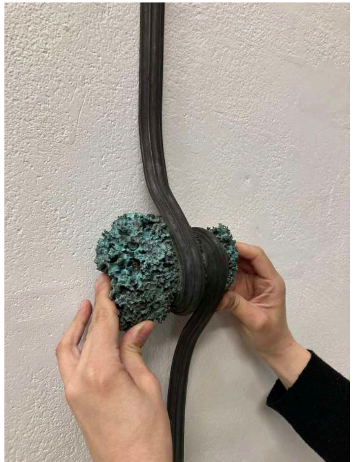
Embrace , 2023 Patinated bronze.

Waves is a glass piece that blends into its environment and responds to it. A barely perceptible in-situ piece, the light brings it to life. It evolves throughout the day and the reflections projected on the wall create a real dialogue with the exhibition space. The texture of the «oceanic» glass refers directly to the shimmering surface of the ocean and the play of reflections echoes it.