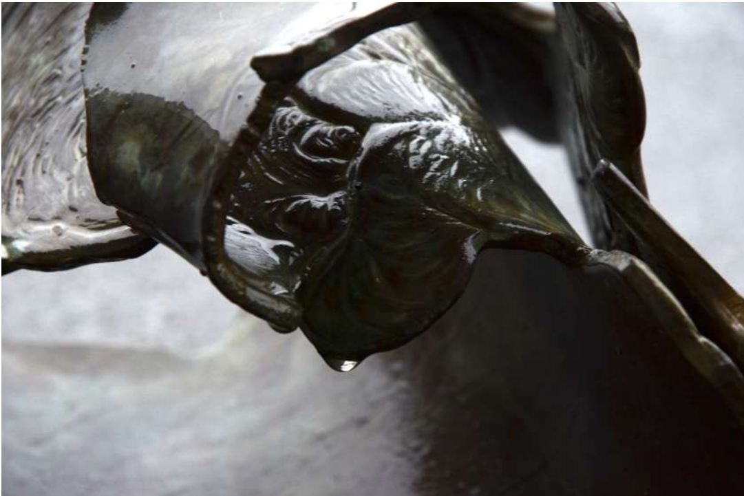
Rip Curl , 2023 42 x 29 x 27 cm, bronze.

Maarten Van Roy combines in his practice handmade sculptures and readymades in order to reveal universal patterns of growth and decay. In his handmade works, like Rip Curl , a unique bronze cast included in the exhibition, the artist deals with self-organization and spontaneous order: a material is attentively listened to and given space to develop its qualities. The shapes, textures and patina of these objects bear witness to that intimate dialogue, as much as to the physical processes, the thermodynamic transformations during their genesis.