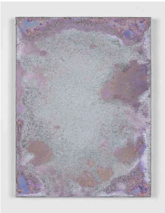
1) Peinture indisciplinée , may 2022 - present Humidity indicator, water, cotton, aluminum plate, screws, 40 x 30 cm

* We borrow the term “unruly” from sociologist Dominguez Rubio Fernando, who describes objects of art with unstable, elusive and complicated behaviour as “unruly”. works that do not necessarily reconcile with established standards in the field of art conservation.