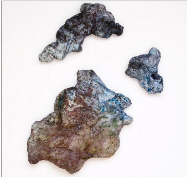
Lecanora Muralis , 2020, agar-agar, mustard glycerine, spirulina, natural pigments, bacteria, upcycled foam, 120 x 100 cm

Charlotte Gautier van Tour was born in Evian-les-Bains in 1989. She lives and works in Marseille. Fermentations, germinations, putrefaction, macerations... Charlotte Gautier van Tour's practice highlights the phenomena that animate our biosphere. In creating her works, she allies herself with algae and micro-organisms such as yeast, bacteria and fungi, creating surfaces of interaction and territories of sensitivity that demonstrate the interdependence and symbiosis between our bodies and other species, as well as the links between microscopic and macroscopic dimensions.